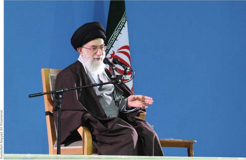
Ayatollah Seyyed Ali Khamenei

The World Trade Organization (WTO) has confirmed Iran sent a summary of its commercial policies to the global trade regulator to start membership talks.